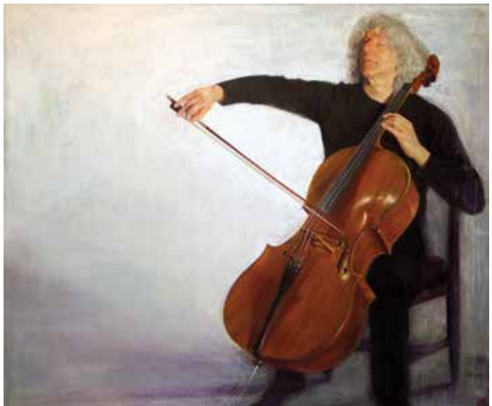
Luis Alvarez Roure, Golden Moment: A Portrait of Steven Isserlis , oil, 50 x 60" (127 x 152 cm)