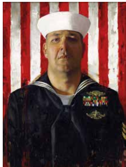
Luis Alvarez Roure, Hidden Wounds , oil, 24 x 18" (60 x 45 cm). Finalist in Outwin.